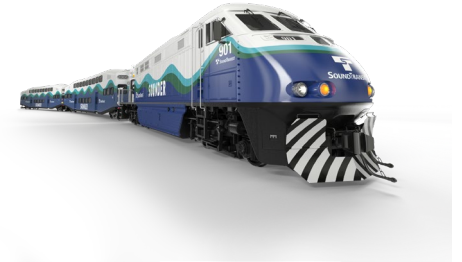
Sounder Weekday Special Event adds and schedule changes