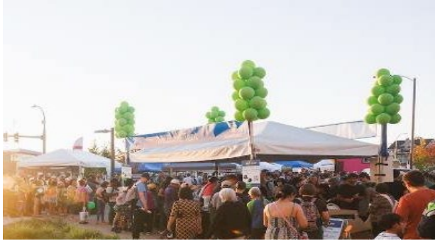
International District / Chinatown Station Activation Partnership